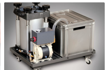
Enviro recirculating filtering unit (1 micron)