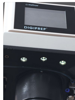
LED lighting to illuminate the working area