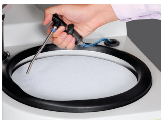
Retractable water hose for easy cleaning

Enviro Filter Unit is a closed loop recirculating filter system which is optionally available. It has a 20 lt reservoir capacity with 1 micron filter entering the grinder / polisher intake. Enviro can also be coupled with line water and 80 micron filtering system for disposal.