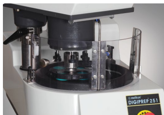
Special plexyglass protection unit