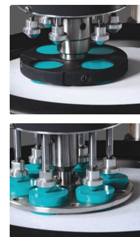
Central Force application Individual force application