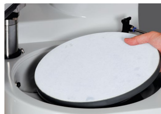
Simple exchange of working discs