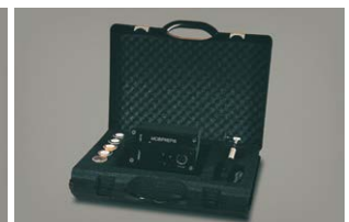
Hardcase Protection & Carrying Bag