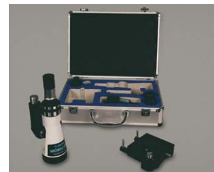
Aluminum Transport Case