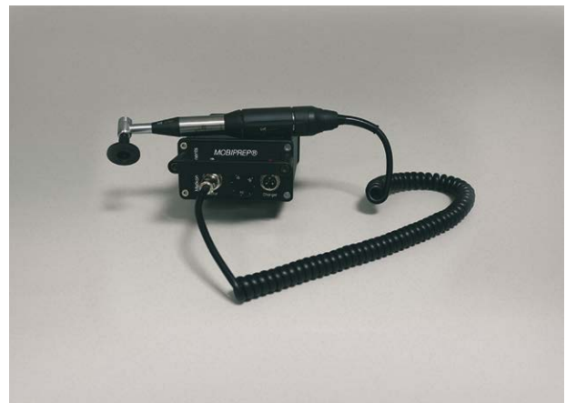
MOBIPREP Grinder and Polisher

With the etching pen MOBIPREP may be used for electrolytic etching. Thus working in field with alloyed steels is possible which can be etched by weak electrolytes instead of strong acids.