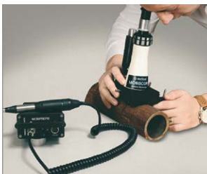
MOBISCOPE Portable Microscope