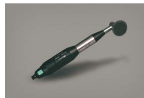
Hand-Guided Grinding-Polishing Device