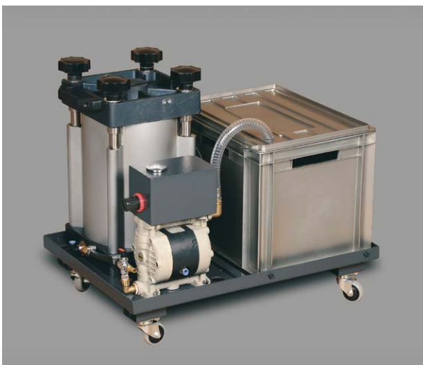
Enviro recirculating filtering unit