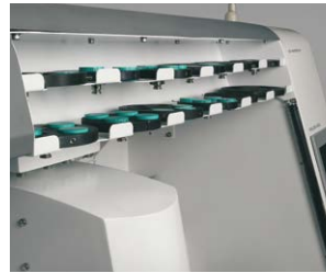
Storage For Specimen Holders

Two Built-in Peristaltic Dispensers are located in the cabinet and guarantees exactly the same dosing every time. Diamond suspensions / lubricants and aluminum oxide suspensions can be fed. Dosing parameters like; frequency, fluid selection etc. are controlled through the programme memory of the VELOX 402. Each dispenser has 3 peristaltic pumps for diamond suspensions / lubricant and 1 pump for aluminum oxide suspension. The liquid is dosed exactly to where the operator wants it on the polishing cloth. No vaporization or spray mist occurs.