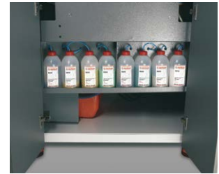
Automatic Fluid Dispenser