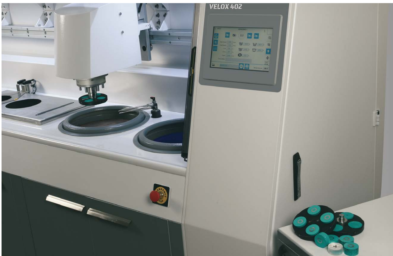
Fully Automatic Programmable Grinding/Polishing System

VELOX 402 has the highest safety standards. The equipment is provided with safety light curtain allowing easier process monitoring and easier access to the preparation area. It prevents access to moving or rotating parts during operation. When operator fingers, hand and ankles approaches to the operation area, the equipment stops immediately. A stack light is located on the top of the equipment to provide visual and audible indication of machine status.